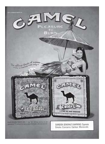
Figure 3.3. Advertisement for Kauai Kolada and Twista Lime flavoured cigarettes (Camel Exotic brand)