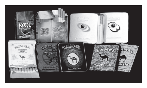
Source: reproduced, with the permission of the publisher, from reference 15.

The candy-like flavouring agents not only affect the sensory perception and inhalation, including changes to smoke irritation, smoothness, aroma and smoking topography; their pyrolysis also alters the overall chemistry of smoke and its toxicity.